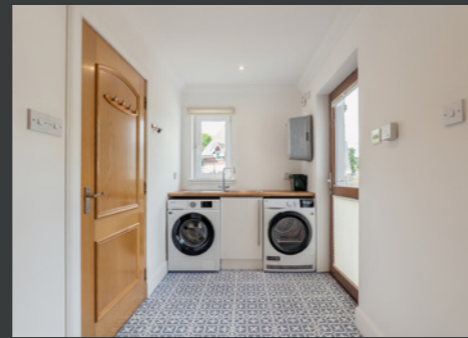
Beau Couer 4 Ruthvenmill View