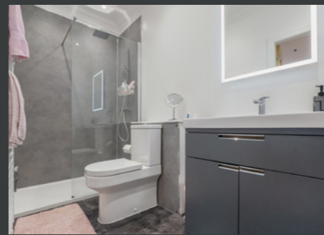
Beau Couer 4 Ruthvenmill View